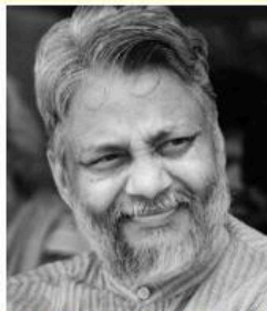
Dr. Rajendra Singh

Ramon Magsaysay Awardee, Waterman of India